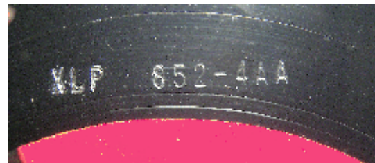
US COLUMBIA NEWER MATRIX

US Columbia follows similarly. Note that both matrix numbers are the same. The RIAA issue, however, has smaller Arial font, and also larger Take Numbers.