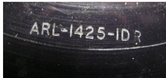
LONDON/DECCA NEWER MATRIX