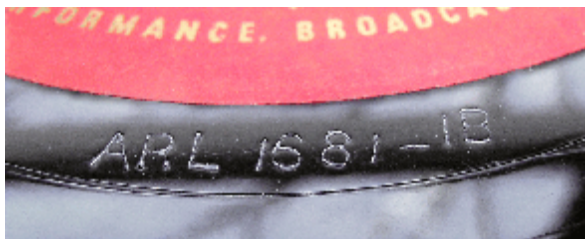
LONDON/DECCA OLDER MATRIX

Most commercial, pre-RIAA records had matrix numbers that were of larger, often cursive fonts, and were raised from the surface. Their characters appeared to be made with punches. Most RIAA discs had smaller, more Arial fonts and appeared to be etched into the surface. You can use a toothpick and magnifying glass to help determine this.