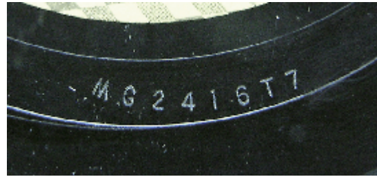
US DECCA NEWER MATRIX

US Decca has a similar distinctive matrix identification. Also note the higher "Take Number," or "Stamper Number." Usually, smaller Take Numbers are associated with pre-RIAA records. The record on the left requires 800/-8 dB equalization in order to make it sound like the RIAA on the right.