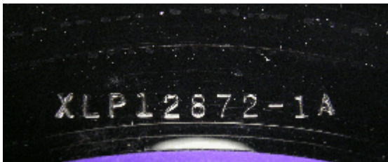
US COLUMBIA OLDER MATRIX (Version 2)

US Columbia follows similarly. Note that both matrix numbers are the same. The RIAA issue, however, has smaller Arial font, and also larger Take Numbers.