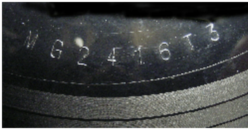
US DECCA OLDER MATRIX

The photos above are of British London/Decca LPs made circa 1954. The left matrix number has the raised, large font commonly associated with RIAA/-10 dB equalization. The right matrix number, ARL-1425, would ordinarily indicate an earlier equalization; however, it has the engraved into font associated with RIAA/RIAA equalization. Also, note the "R." That signifies remastered for RIAA.