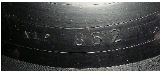
US COLUMBIA OLDER MATRIX

US Decca has a similar distinctive matrix identification. Also note the higher "Take Number," or "Stamper Number." Usually, smaller Take Numbers are associated with pre-RIAA records. The record on the left requires 800/-8 dB equalization in order to make it sound like the RIAA on the right.