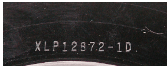
US COLUMBIA NEWER MATRIX

Sometimes font characterization is not enough. Above, only the take number and label are different.